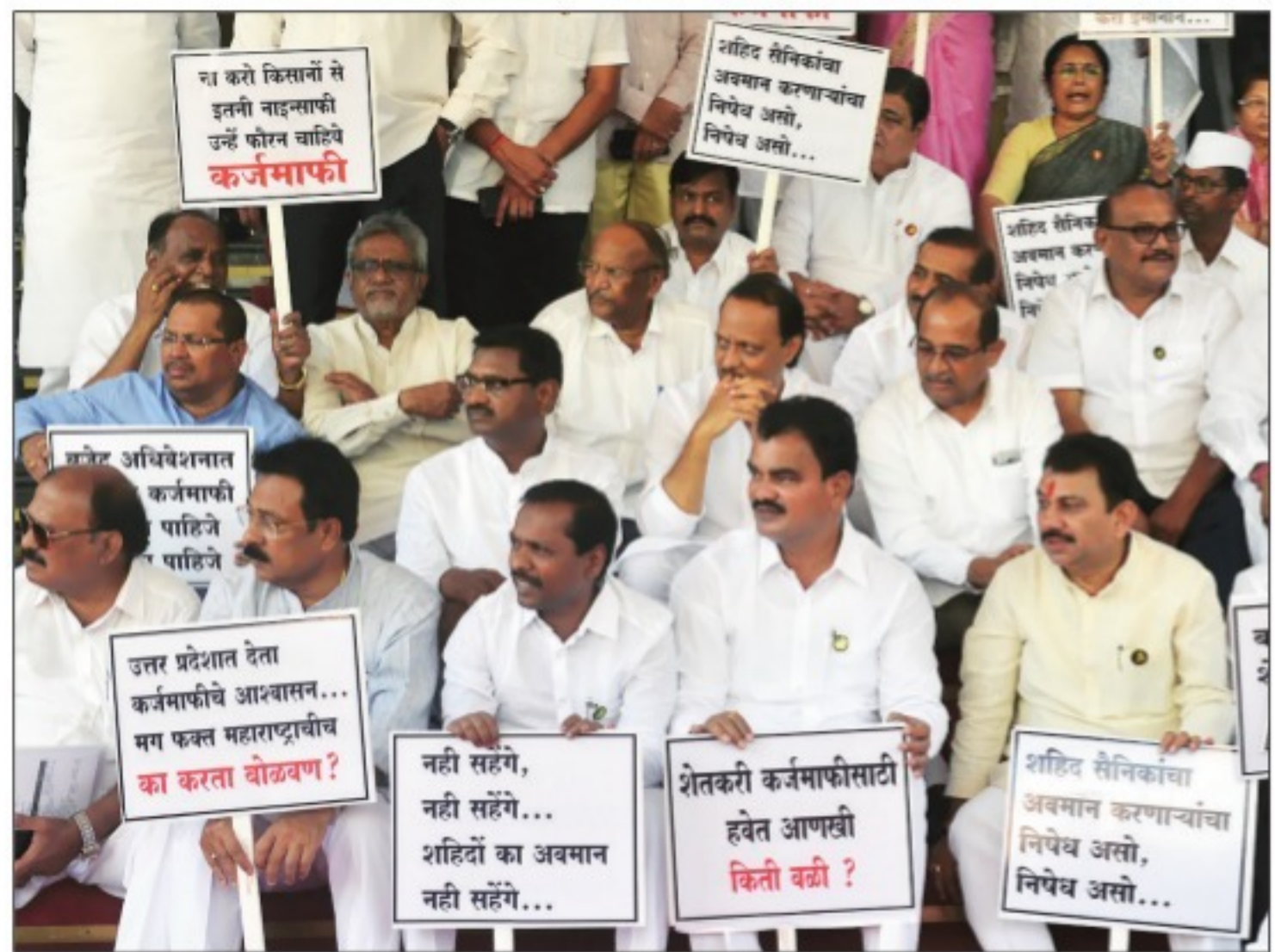
Congress and NCP MLAs protest at Vidhan Bhavan on Wednesday.